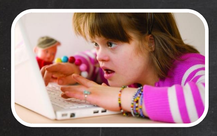
Protection vs Exposure